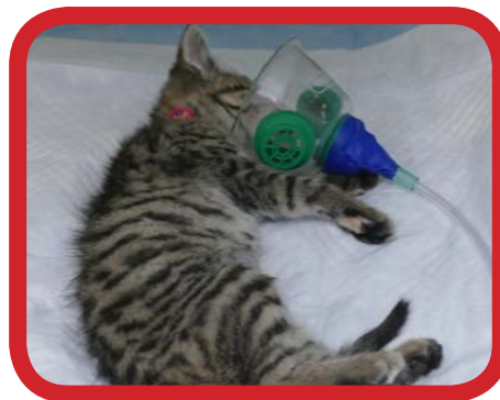
One of our little patients